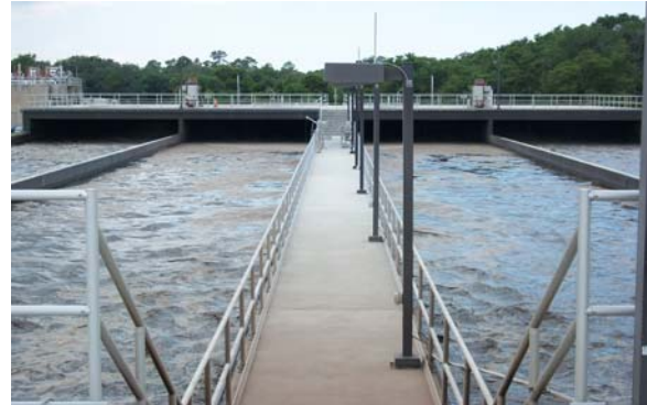
Nitrification and denitrification processes occur in the same basins requiring precise aeration control that maintains the appropriate balance of rich and oxygen deficient environments.

Manager. "We expanded the plant to 12 MGD, but we're not operating at that level yet. We're closer to 6 MGD. But sometimes our flows come in at 9 to 10 MGD, and during the weekends we can reach continuous flow rates of 10 MGD all day long. So the ultimate goal for me is to run a more efficient process with better process control."