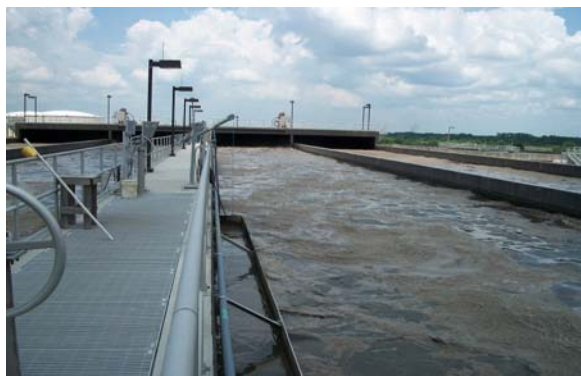
Prior to installing ChemScan online process analyzers, operators manually adjusted blower speed at the control boxes located near the aeration basins.

“To change the speed of our aerators, we literally had to leave the operations building and climb on top of our aerators or go to a motor control center to increase or lower the speed. But online monitoring and real-time control has removed the guesswork from optimizing our nitrification and denitrification processes. Now the ChemScan automatically collects and tests the samples and then adjusts the aerators accordingly. It’s all automatic and provides more precise control of our nitrification and denitrification processes.”